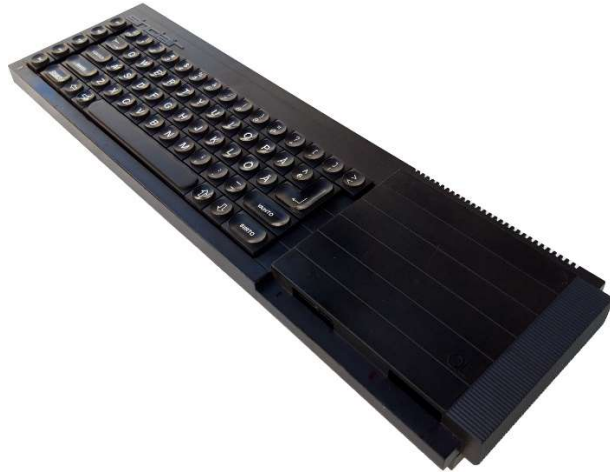
A Sinclair QL

I was about 8 when my uncle gave me his 'obsolete' Sinclair QL, complete with the original Psion software. I found the microdrives fast and novel (and reliable, despite what many say). The QL was the first time I had ever loaded software from removable media, as up to that point I had used a ZX81 and didn't even have a tape recorder to save/load stuff with! As a child though, all I had was the Psion suite of word processor, database, spreadsheet and business graphics and they didn't hold my attention for all that long. I had no idea where to obtain further software for it and the huge, very adult user guide went mostly over my head (much of it still does)!