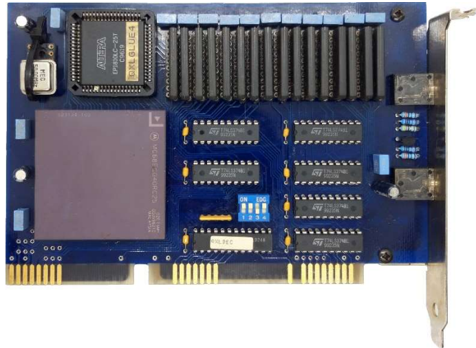
A QXL 2(B) card from the late 1990s

QXL/QXL2 - was an ISA expansion card introduced in the mid 1990s. Once inserted into a spare ISA slot in a host IBM compatible PC, it takes over the PC and turns it into a QL compatible system! The QXL/QXL2 had access to the PC's devices and connections, like the floppy drive(s), serial ports and it was able to create and have exclusive use of a special portion of the PC's hard drive. They used SMSQ/E (or its predecessor) and had up to 8mb RAM on board.