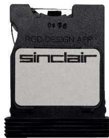
The top of a Sinclair Microdrive Cartridge