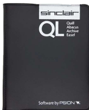
The wallet containing the free Psion software